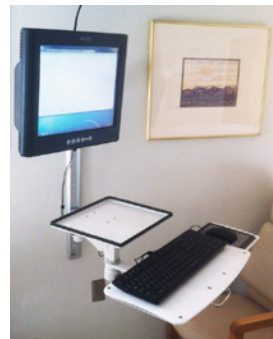
Monitor, service tray and keyboard on Ultra Arm wall track system.