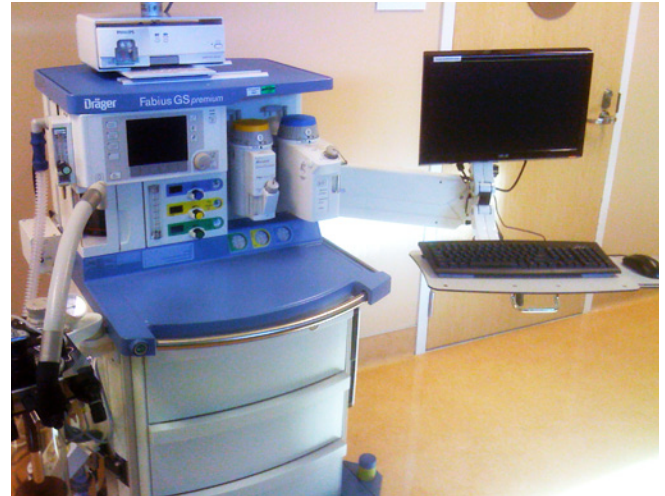
MD Arm with Paralink, monitor and keyboard on a Draeger anesthesia cart.