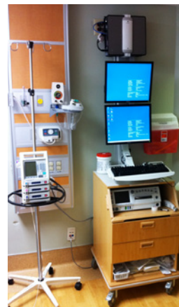
Dual monitors on a fetal monitor cart.