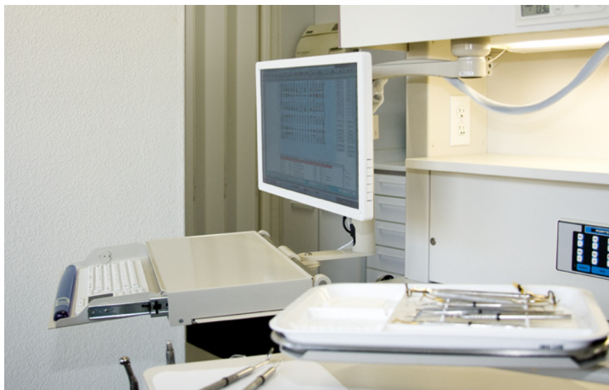
Undercabinet workstation with WorkSurface Keyboard Tray.