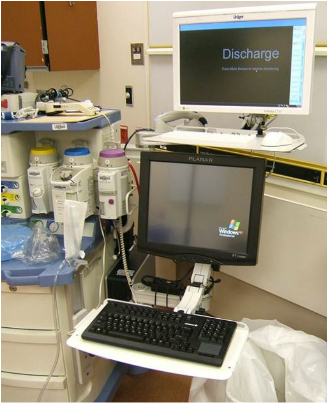
Dual monitors, scanner and service tray supported by Titan Arms on an anesthesia cart.

ICW's in-house engineers work with you to define, create and test your mounting solution.