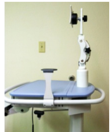
Paralink monitor mount on a medical cart.