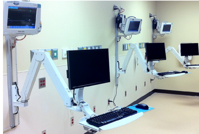
Philips monitors on wall tracks with Elite Double Arm mounts supporting monitors and keyboards.