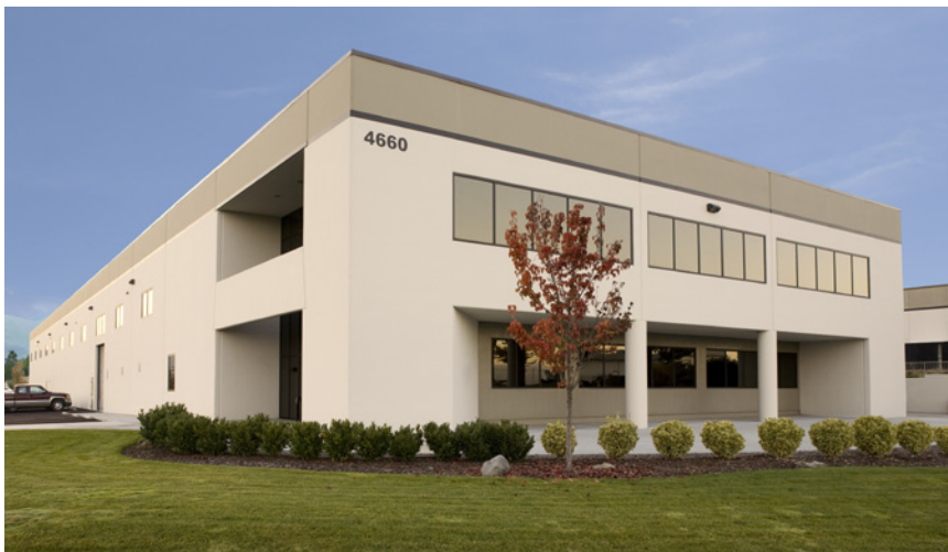
Grumman Building: Assembly and Shipping