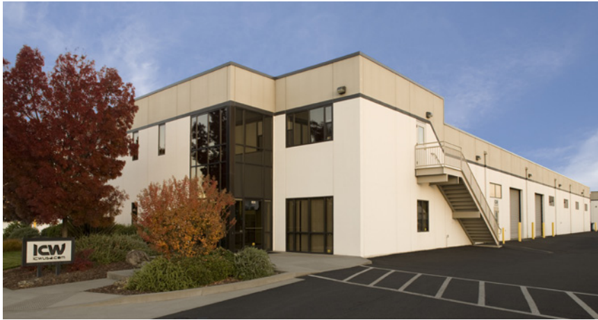
Kingsley Building: Administration, IT, Engineering and Manufacturing

Watch a video tour of our plant at www.icwusa.com