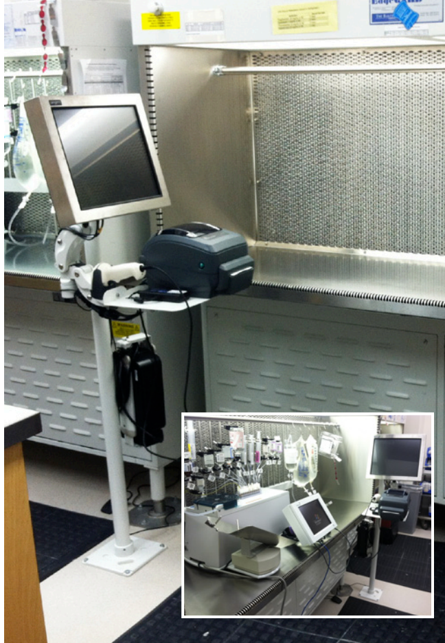
Ultra Pole Mount configuration for Baxter DoseEdge Medication Delivery System in a pharmacy clean room. The mount holds a touchscreen monitor with scanner and Zebra printer.