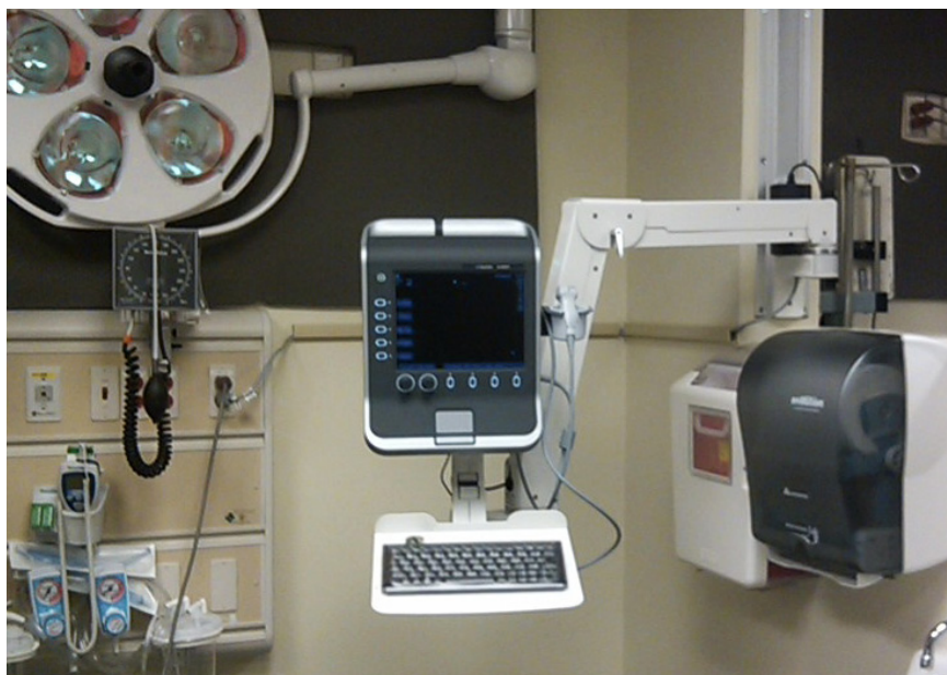
SonoSite S-Fast Ultrasound Machine mounted on an Elite Double Arm. This setup can be shared between two trauma bays in the Emergency Department.